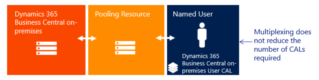
Figure 2: Multiplexing

Note: Multiplexing does not reduce the number of user licenses required.