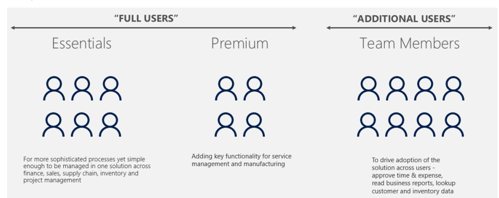
Figure 3: user Types

Full Users receive unrestricted direct or indirect access to all of the functionality in the licensed server software including setting-up, administering, and managing all parameters or functional processes across the ERP Solution. Full Users require more write capabilities that those available to Team Members.