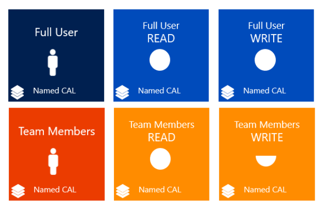
Figure 4: Full User vs. Team Members Licenses

Team Members get restricted access to the ERP Solution to complete only the following tasks: